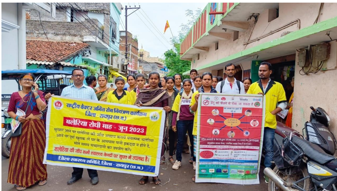
Malaria Month Activities, 2023 celebration in district

FH India conducted various community drive events, like Sanitation drives were conducted by village youths to make community aware about use of household toilets by all members, storage and handling of drinking water, handwashing practices by all household members, communication Van, National Dengue Day, National Youth Day, World Malaria Day.