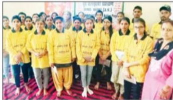
फेमिली हेल्थ इंडिया की कार्यशाला में शामिल लोग।

कानपुर (एसएनबी)। रामा देवी में गुरुवार को जिला स्वास्थ्य समिति के तत्वावधान में मलिन बस्तियों के 21 युवा स्वयंसेवकों को प्रशिक्षण दिया गया। बस्तियों में मच्छरों की पैदाइश रोकने के लिए साफ सफाई, लार्वा नाशक रसायन का छिड़काव व अन्य गतिविधियों की जानकारी दी गयी।