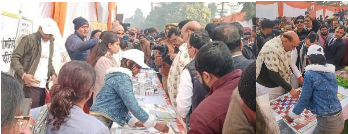
IECBCC display in Health Mela