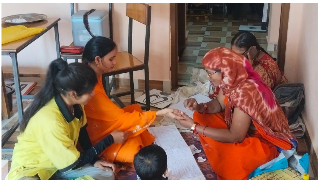
Blood testing by ASHA, Jabalpur

ASHA/USHA workers were initially not confident in administering the rapid diagnostic testing kit (RDT) for malaria. After hands-on training and technical trainings using e-modules developed by FH India, they started testing and reporting cases. They also learned dose and medicine administration for malaria. As a result of that screening and testing, number of suspected malaria cases increased and were linked to treatment.