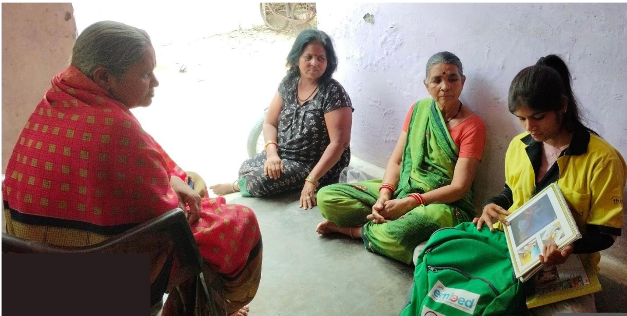
Home Visit session on malaria

FH India conducted various community drive events, like Sanitation drives were conducted by village youths to make community aware about use of household toilets by all members, storage and handling of drinking water, handwashing practices by all household members, communication Van, National Dengue Day, National Youth Day, World Malaria Day.