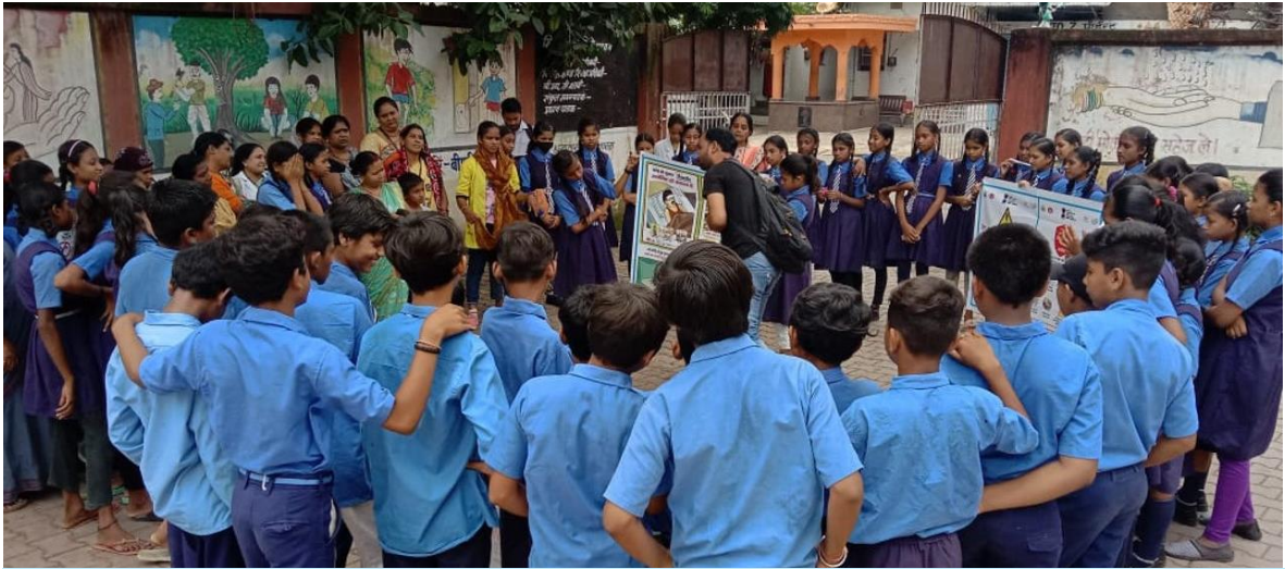
Students learning about malaria through play-way method